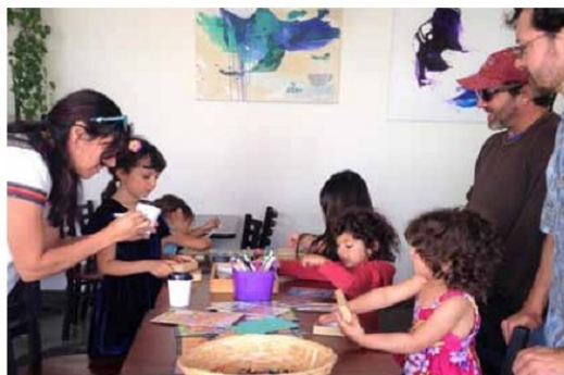
What Creation Looks Like--Itsy Bitsy artists and writers bend to their tasks.